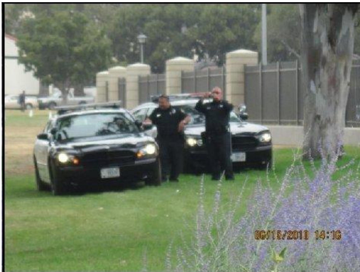
VA policeman are videotaping Veterans outside the gates of Veterans property. What evil crime could elderly Veterans possibly be committing?