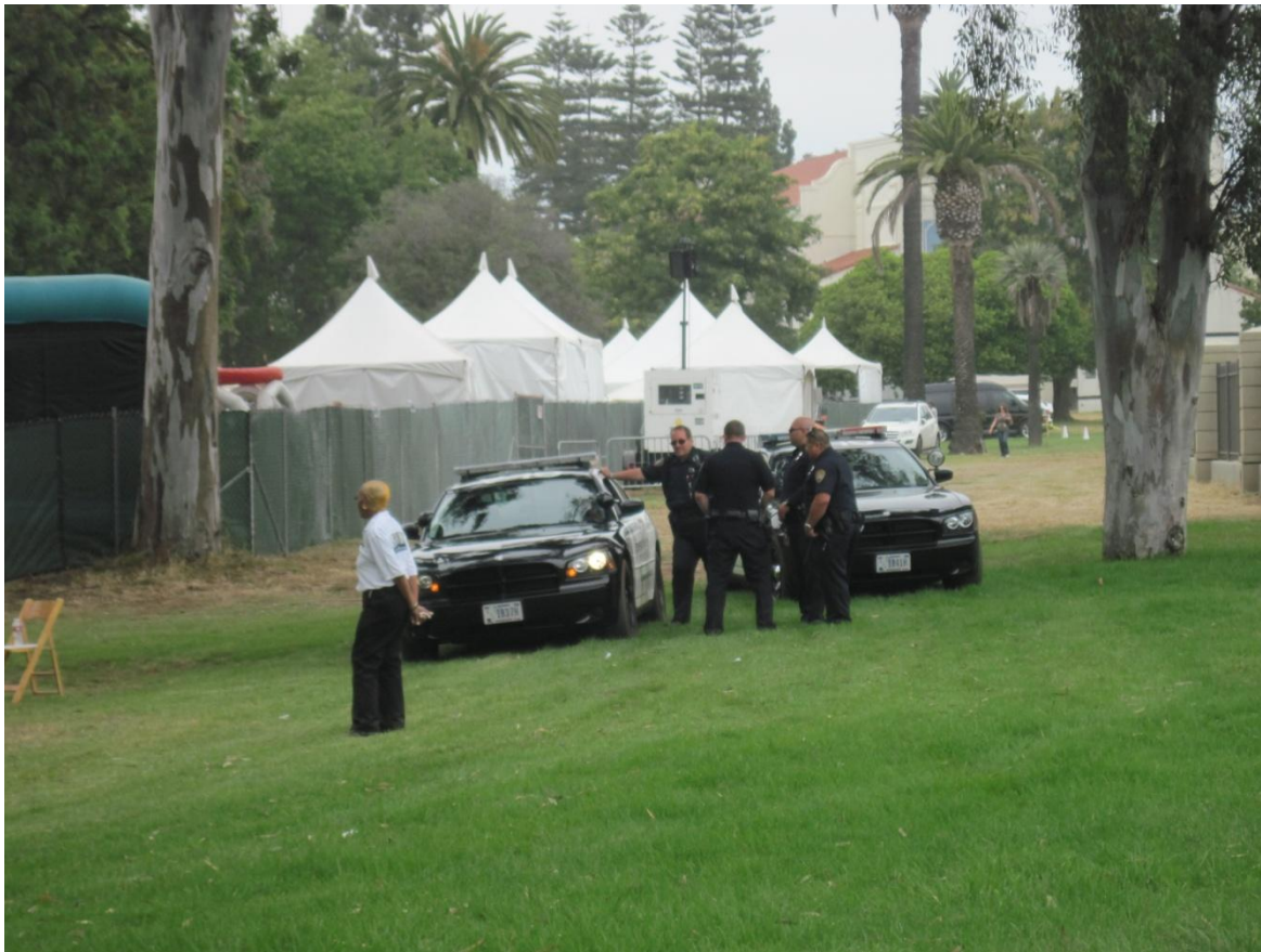
Four VA policemen on foot patrol discuss strategy with officers in two squad cars. They are between the protective fence of the “Celebrity Carnival” and the VA fence along Wilshire Boulevard. The individual in the foreground, is a private security guard hired by the carnival, as the VA police were ordered to stay outside the carnival and monitor the Veterans Grand Rally on the public walkways, which are out of their jurisdiction.